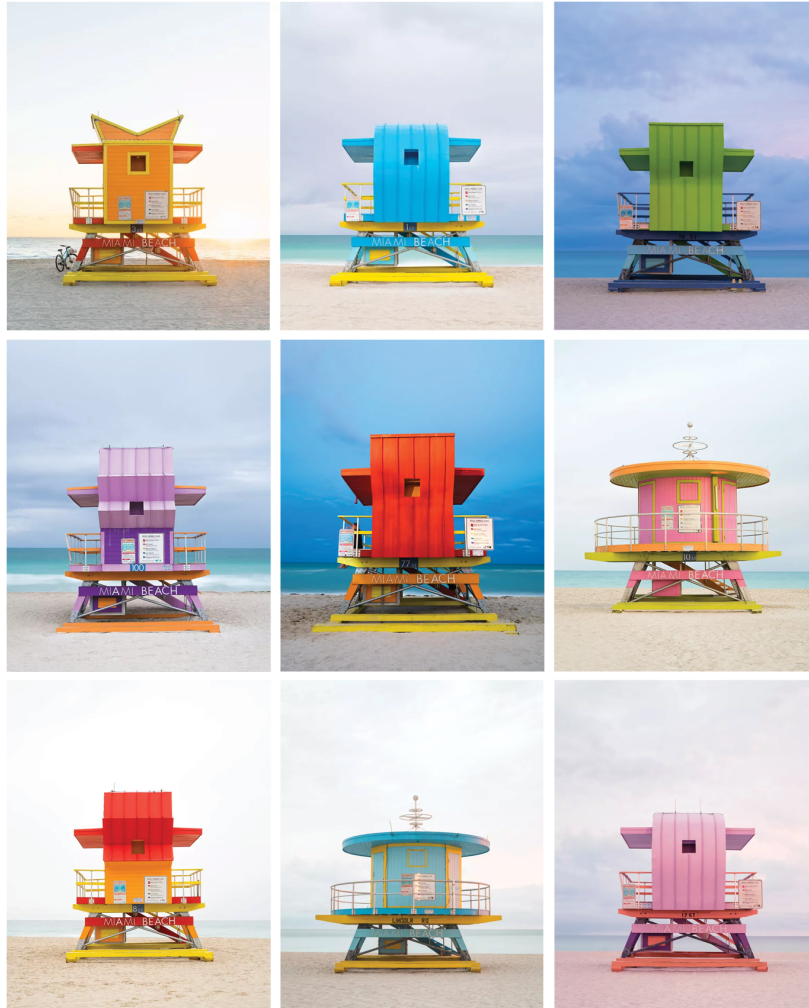
Selected lifeguard stands by WLA: