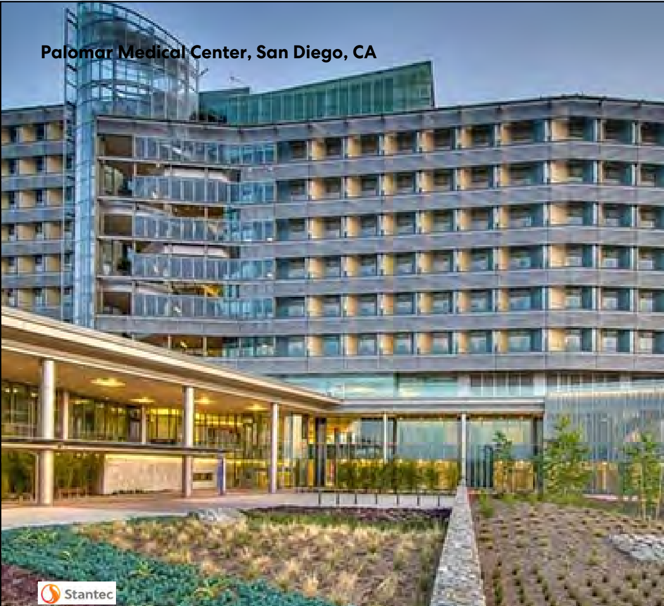
Palomar Medical Center, San Diego, CA