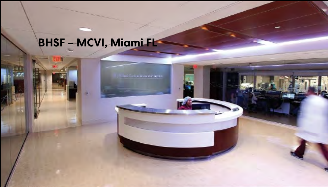
BHSF – MCVI, Miami FL