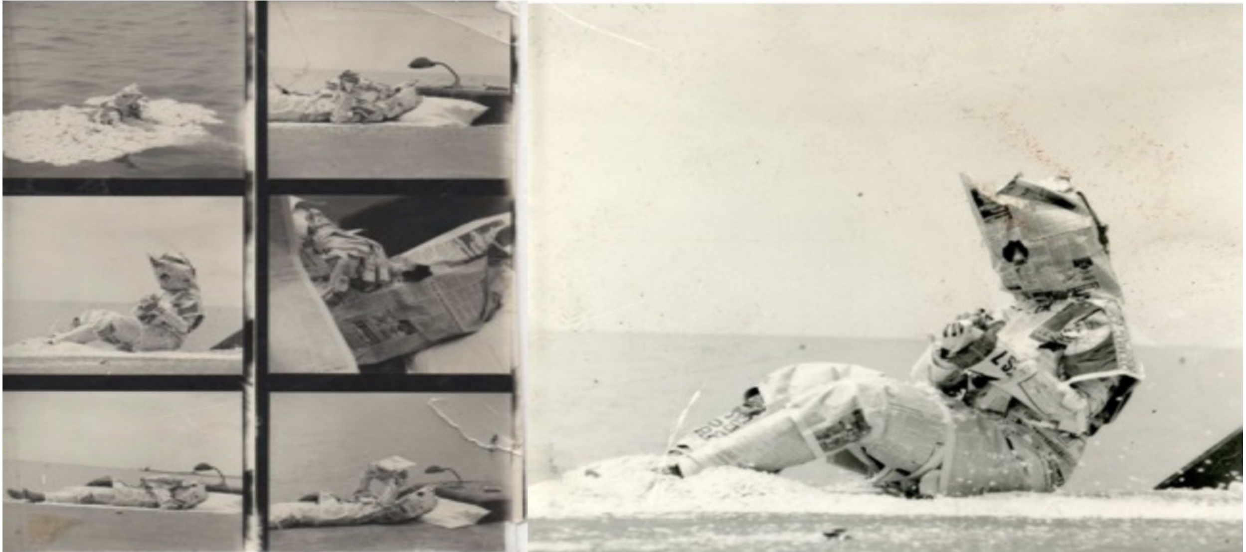
Fig. 5. Marta Minujín, Leyendo Noticias , happening, 1965.