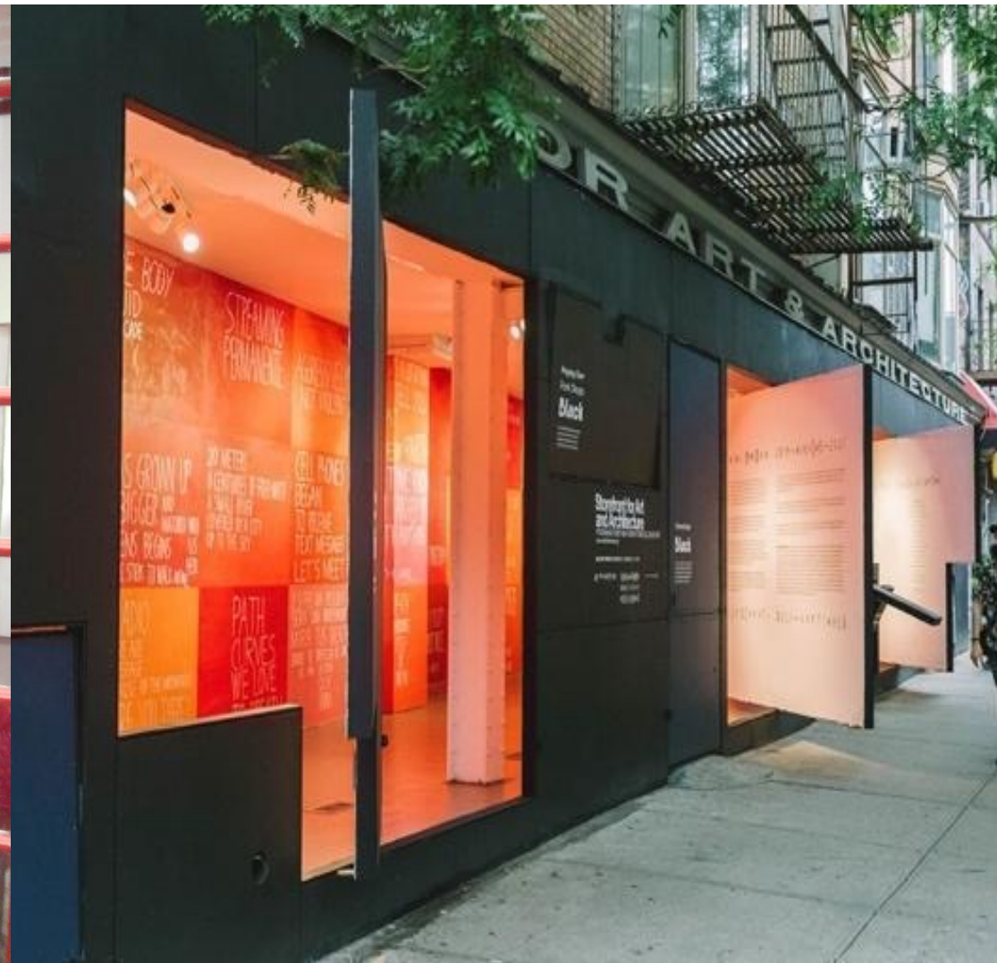
Fig 11. Scafati. Windows . Installation, New York, 2021.