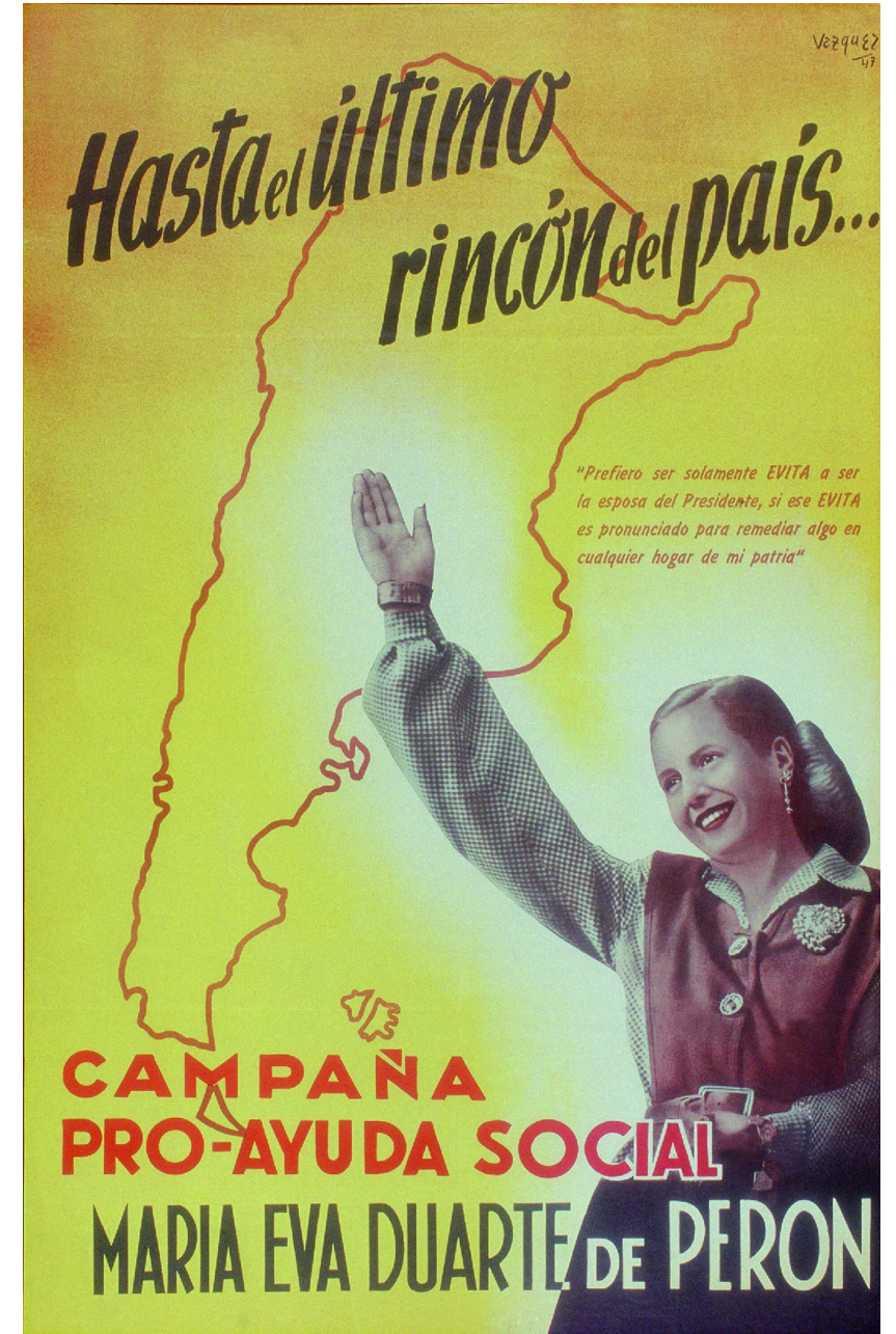
Fig. 4. Evita, Abanderada de los trabajadores. Afiches Del Peronismo, 1947.