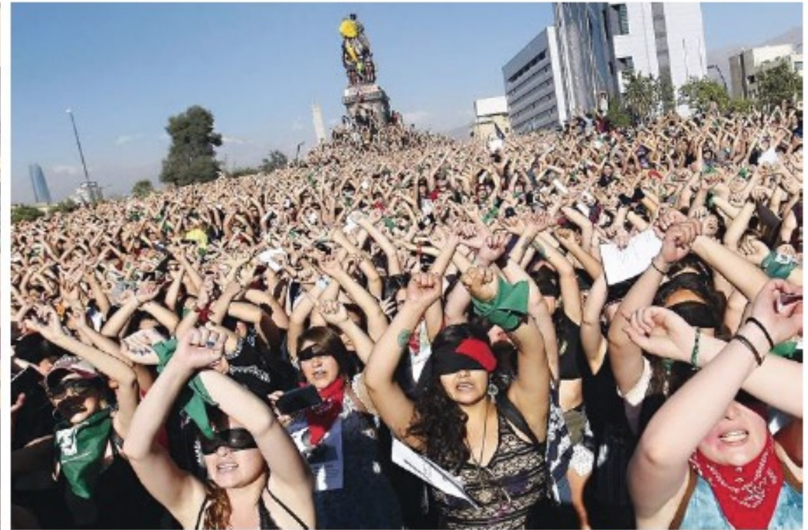
Fig. 8. LasTesis collective.