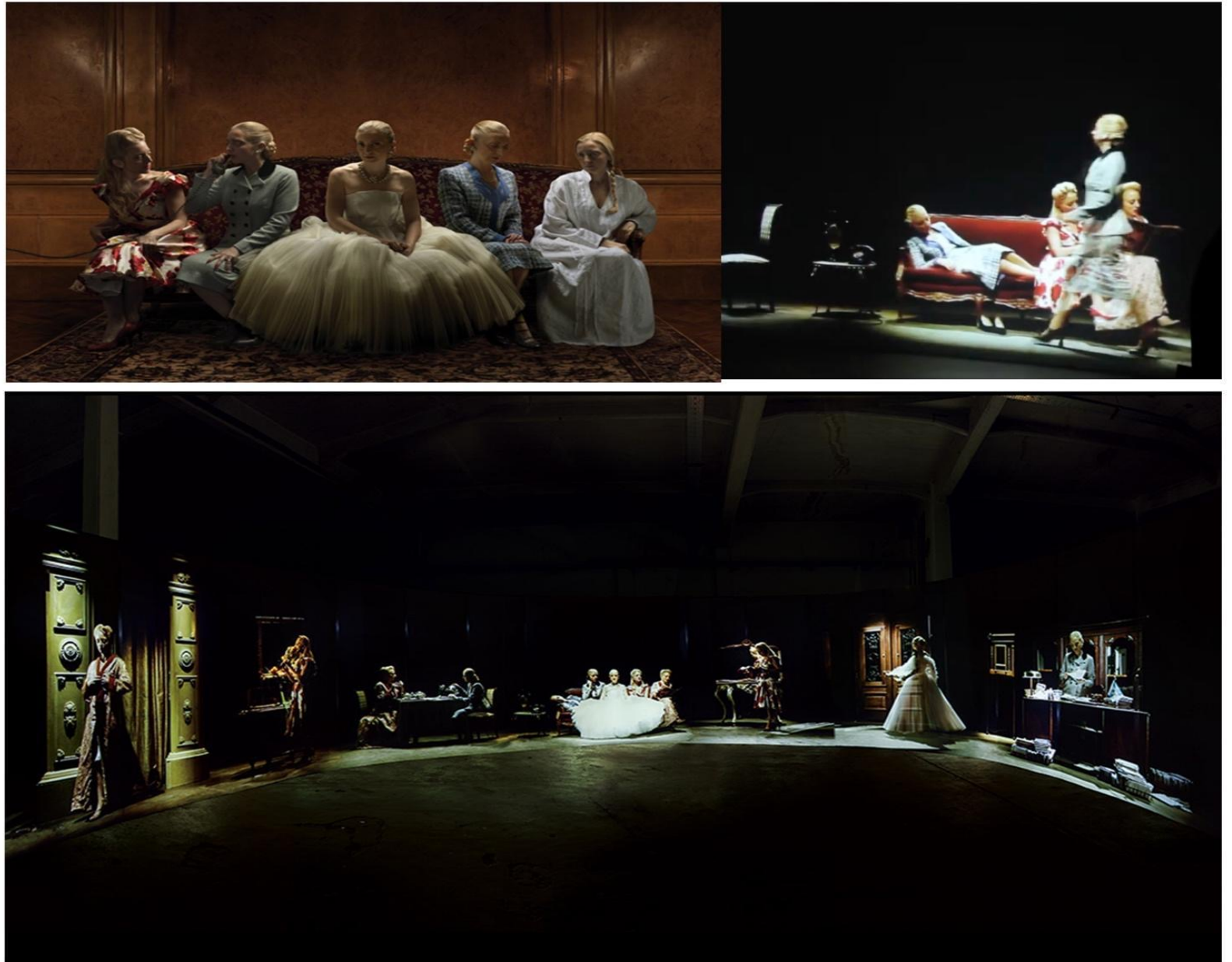
Fig. 7. Costantino, Nicola. Eva, los sueños . 55th International Art Exhibition, La Biennale di Venezia, 2013.