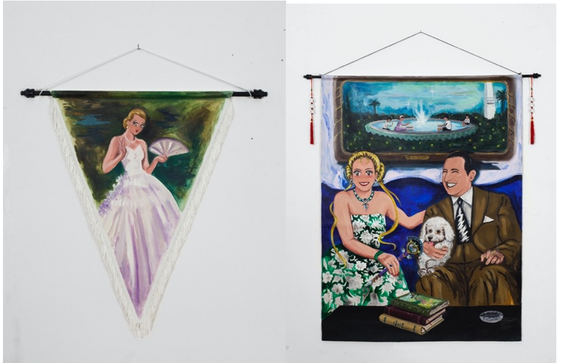
Fig. 9. Fátima Pecci Carou, Series banderías.