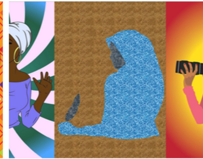
VELD KORNET, Lynott, MORABE, The Creative Feminine 2023