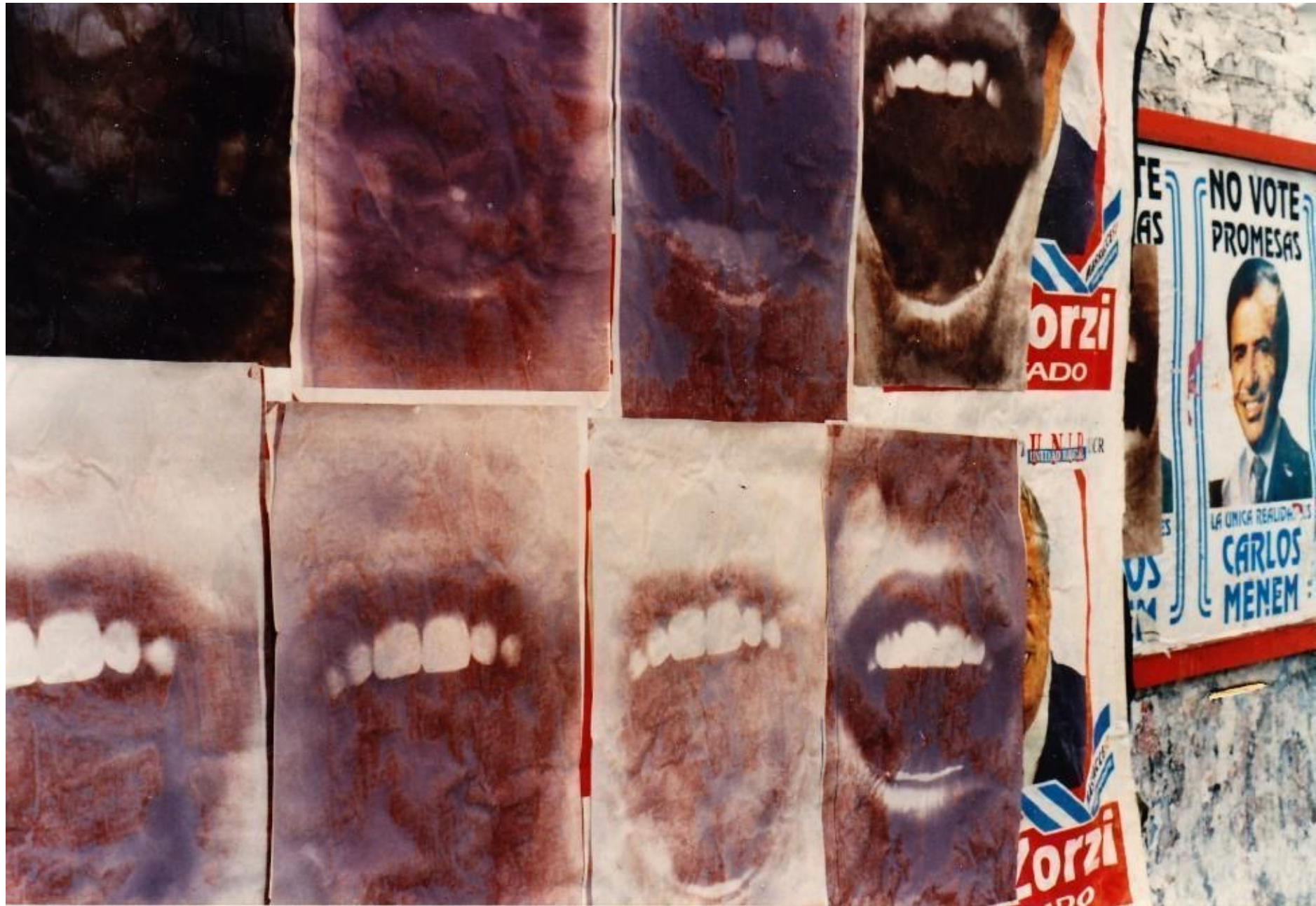
Fig. 6. Graciela Sacco. Serie Bocanadas . Prints on posters, Urban interventions, Buenos Aires, Rosario, 1994. Variable dimensions.