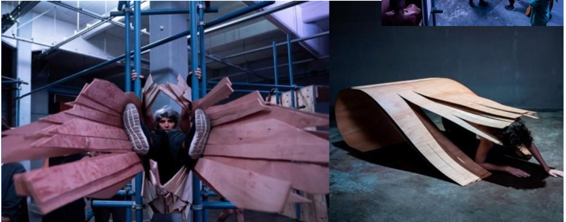
Fig. 12. Luciana Lamothe. Invocar el acto , Performance at cheLa, Buenos Aires, 2022.