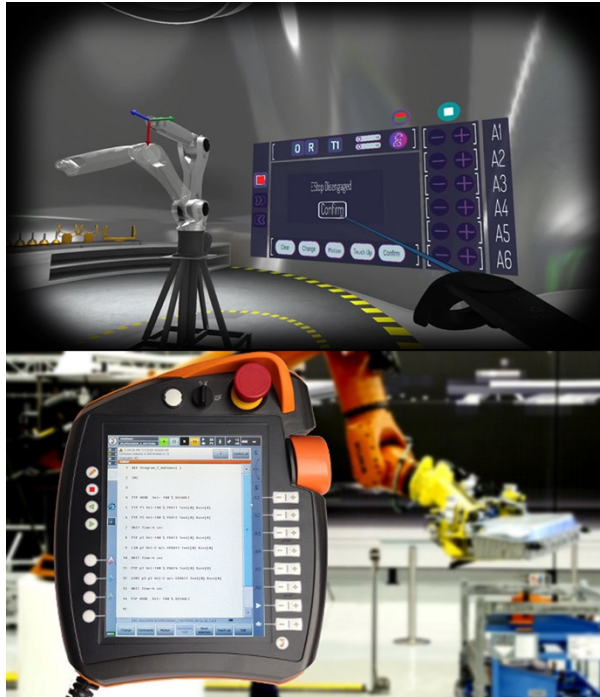
Fig. 3. Top: Scene from the VR learning prototype demonstrating how the command panel corresponds to Bottom: a physical teach pendant in real world.

learner with an experience of interacting with simulated robots that closely approximated real-world interactions.