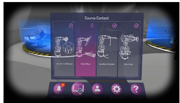
Fig. 1. Scene from the VR learning prototype demonstrating lesson selection process.

ways. The curriculum approaches robotics in a comprehensive framework that includes introductory to advanced concepts as fundamental units in a highly granular armature that can be adapted and re-ordered for a broad range of learner competencies and learner objectives. Unlike many other training systems, our curriculum has the capacity to customize the learning sequence and content range for each individual learner, and it uses interactive content to reinforce both self-reported and performance-measured competencies.