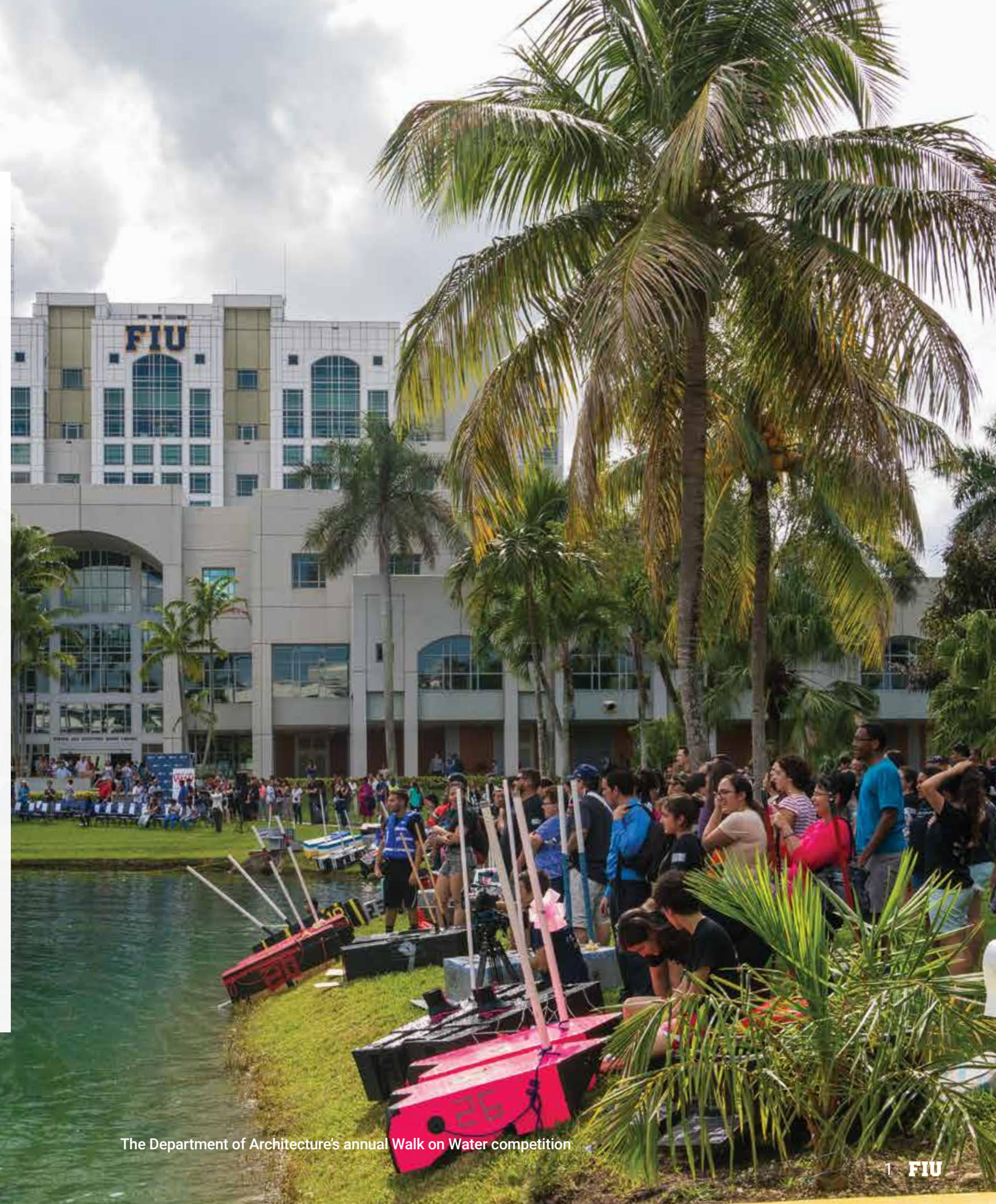
The Department of Architecture's annual Walk on Water competition